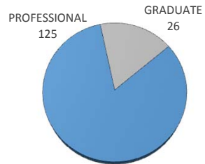
CREDIT HOURS ENROLLMENT BY CLASSIFICATION